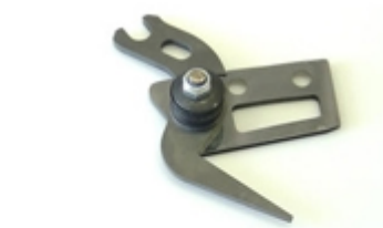
RH COMPLETE Scissors For Re-Entry Tucking Machine