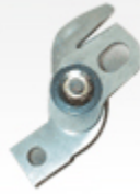
Dornier Weaving Machine Selvedge / Right Side 705804