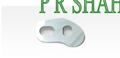
Dornier Weaving Machine Right Side 322552