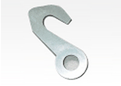
Dornier Weaving Machine 471105