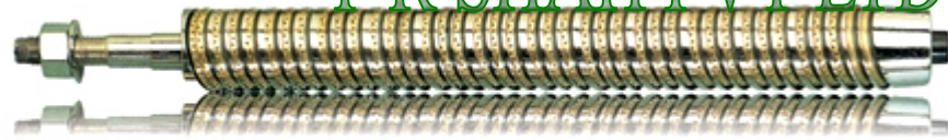
For Medium-Heavy Weight Fabrics