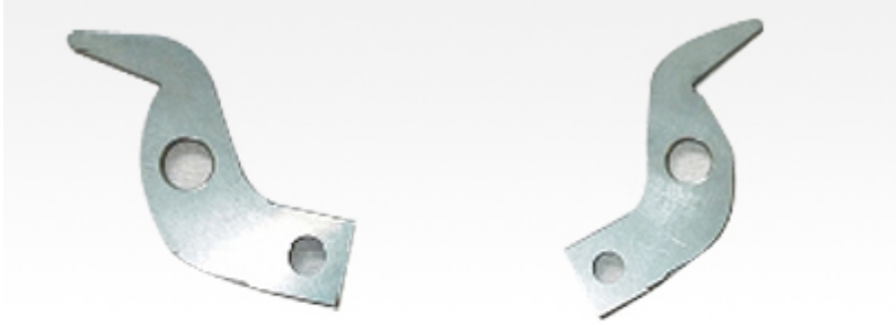
Dornier Weaving Machine Right Side 471188