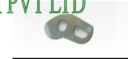
Dornier Weaving Machine Left Side 322553