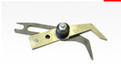
LH COMPLETE Scissors For Re-Entry Tucking Machine