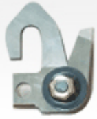
Dornier Weaving Machine Weft 712525