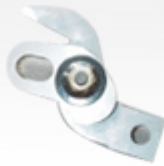
Dornier Weaving Machine Selvedge / Left Side 705805