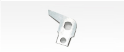
Dornier Weaving Machine 472054